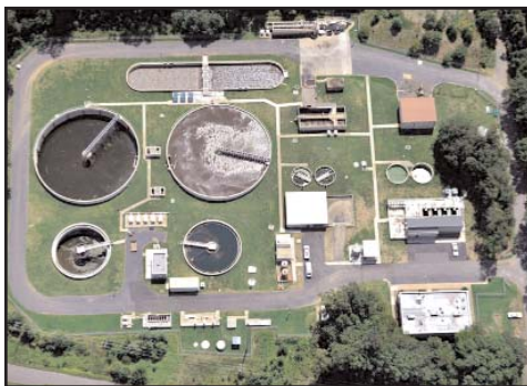
The Remington Plant can treat up to two million gallons of sewage per day.

“We only had one backhoe and a truck,” he recalled. “The idea was good, but larger than they expected.”