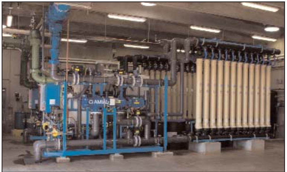
The heart of the Bealeton microfilter plant is the system of pumps and large filters, through which the water from all three wells is cleaned.

Contamination was coming in from the outside and polluting the 350-ft. deep well. A television camera was lowered into the well, revealing that the sanitary seal at the wellhead had been damaged, and that, "... the earthquake had